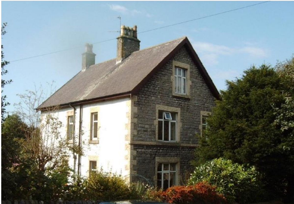
Oswald House 2007