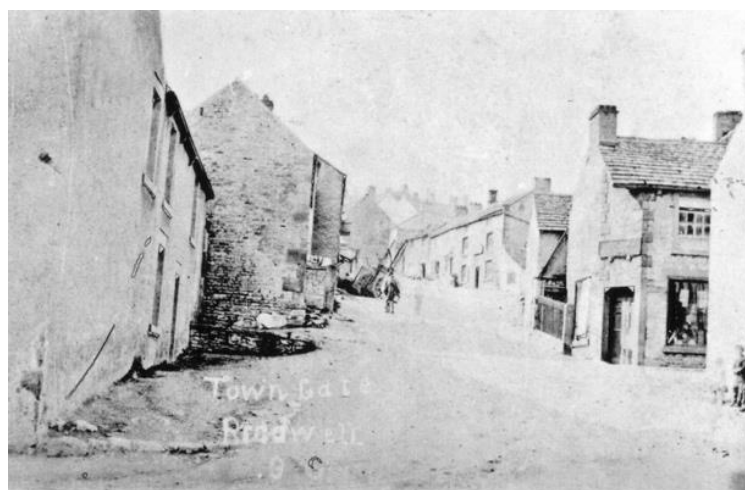
Town Gate 1864

I am attaching a plan of the property room details and photos from 1864, 1910 and 1959 showing how Mr B Shirt expanded into an adjacent building and created a living room in the former shop.