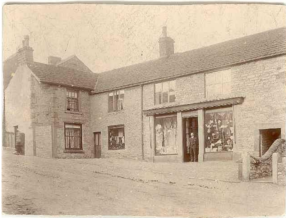
Shirt's House and Shop 1910