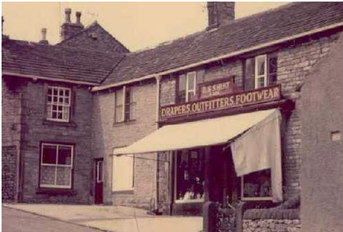
Shirts Shop and House 1959